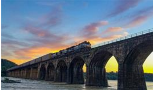
Christin Campbell Photo taken at the Rockville Bridge