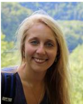
Director of Communications & Outreach