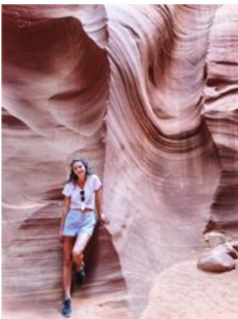
2019 Fall Media & Communications Intern