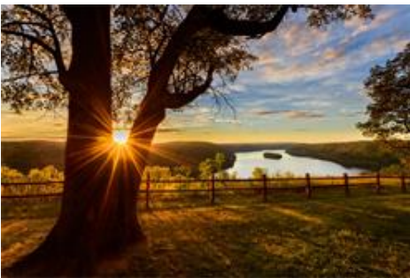
Mark Boyd Photo taken at Pinnacle Overlook