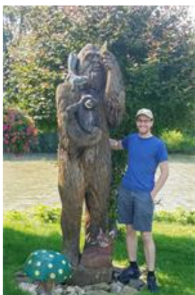
2019-2020 AmeriCorps Greenway & Trails Assistant