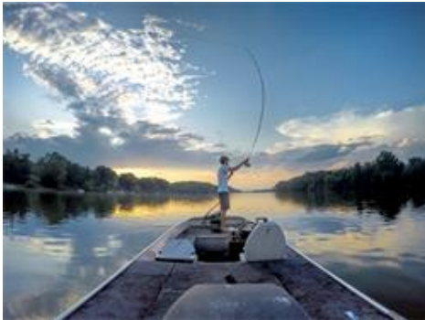
Matt Gutelius Photo taken in Lewisburg, PA