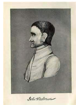
Photo of John Woolman

Many people are aware of the tumultuous relations that often existed between early colonial settlers and Native Americans in Pennsylvania, but few have heard of the efforts of an early Quaker minister from New Jersey. Concerned about the treatment of Native Americans and to help promote peace, in 1763 John Woolman walked over 200 miles from New Jersey to the wilderness of Wyalusing along the Susquehanna River. Today you can celebrate Woolman's efforts by retracing his steps. Covering approximately 220 miles in 15 days, the Woolman Walk will take place from June 8th - 22nd. Join the walk at any time for any distance.