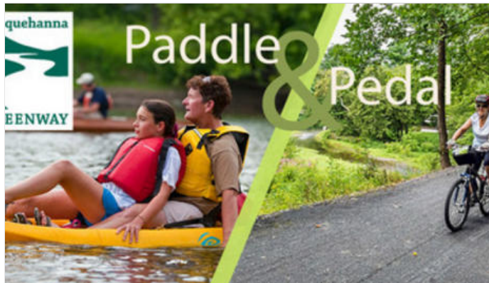
Paddle & Pedal event

"Closing the Gaps" is this year's theme that will explore how the Partnership works to link land and water trails along the Susquehanna Greenway. Local experts will also share area history, wildlife and more.