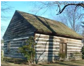
Society of Friends Meeting House

For Columbia County, much of the Underground Railroad history is loosely documented. Rumored sites in the Bloomsburg area are currently privately owned or no longer in existence. Historical evidence does exist that some of the county's large Quaker population provided assistance to those fleeing slavery. Some historians have also mentioned sites in Berwick, Catawissa, Espy, Mainville, and Millville. Certainly, the county's proximity to the North Branch of the Susquehanna River and its watershed would support theories that local groups and individuals aided runaways who used the waterway as a natural guide north into New York. Unfortunately, the majority of known documentation of the region's UGRR activity is focused on the West Branch of the Susquehanna River, and the role the North Branch played in guiding those seeking freedom remains a mystery.