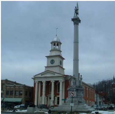
Present day view of “The Diamond”