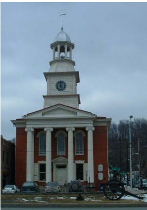
Former Mifflin County Courthouse

Note: Some of the information in this section was provided by the Mifflin County Historical Society.