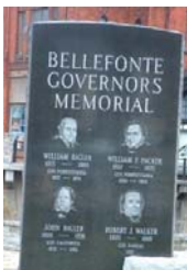
Bellefonte Governors Memorial

Bellefonte was established in 1795 and was the home of seven Pennsylvania governors. The town's residents were active in the Underground Railroad and abolition movement of the 19 th Century. Oral tradition and/or some documentation exist that identifies several