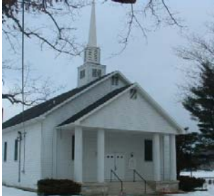
United Presbyterian Church Of Milroy

South Main Street near Kacy Lane, Milroy, PA