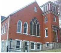
St. Paul AME Church

Started in the 1960s to replace a deteriorated block, Talleyrand Park has been a beautiful work in progress in the center of Bellefonte and includes a gazebo and foot bridges. From here, several historic buildings and state historical markers, as well as the Centre County Tourism Information Center, are within walking distance. The information center is housed in a historic railroad depot located adjacent to the park on High Street, and offers visitors a variety of brochures and guides on the area.