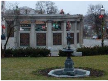
Soldiers and Sailors Memorial

A short walk along High Street takes a visitor past the Governor Andrew Curtin statue and two Commonwealth of Pennsylvania historical markers in front of the Centre County Courthouse. The courthouse was first constructed at this location between 1805 and 1806, and a wing and Grecian columns were added several years later. The rear section of the building was added between 1909 and 1911. The four streets that intersect here are known as the diamond. The statue of former governor Andrew Curtin and the Soldiers and Sailors War Memorial was dedicated in 1906.