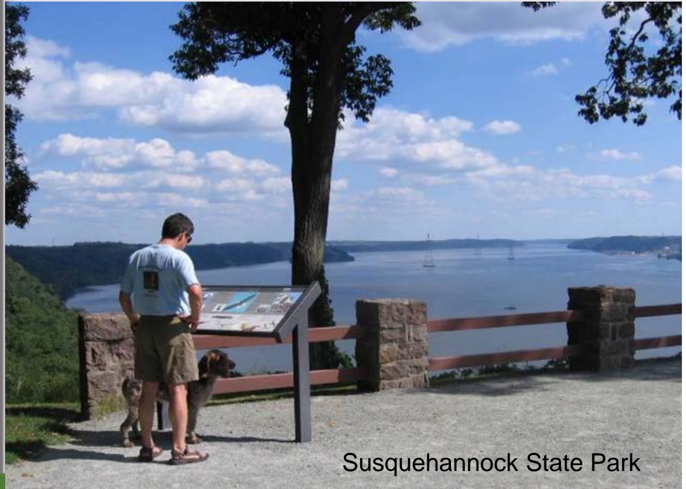
Susquehannock State Park